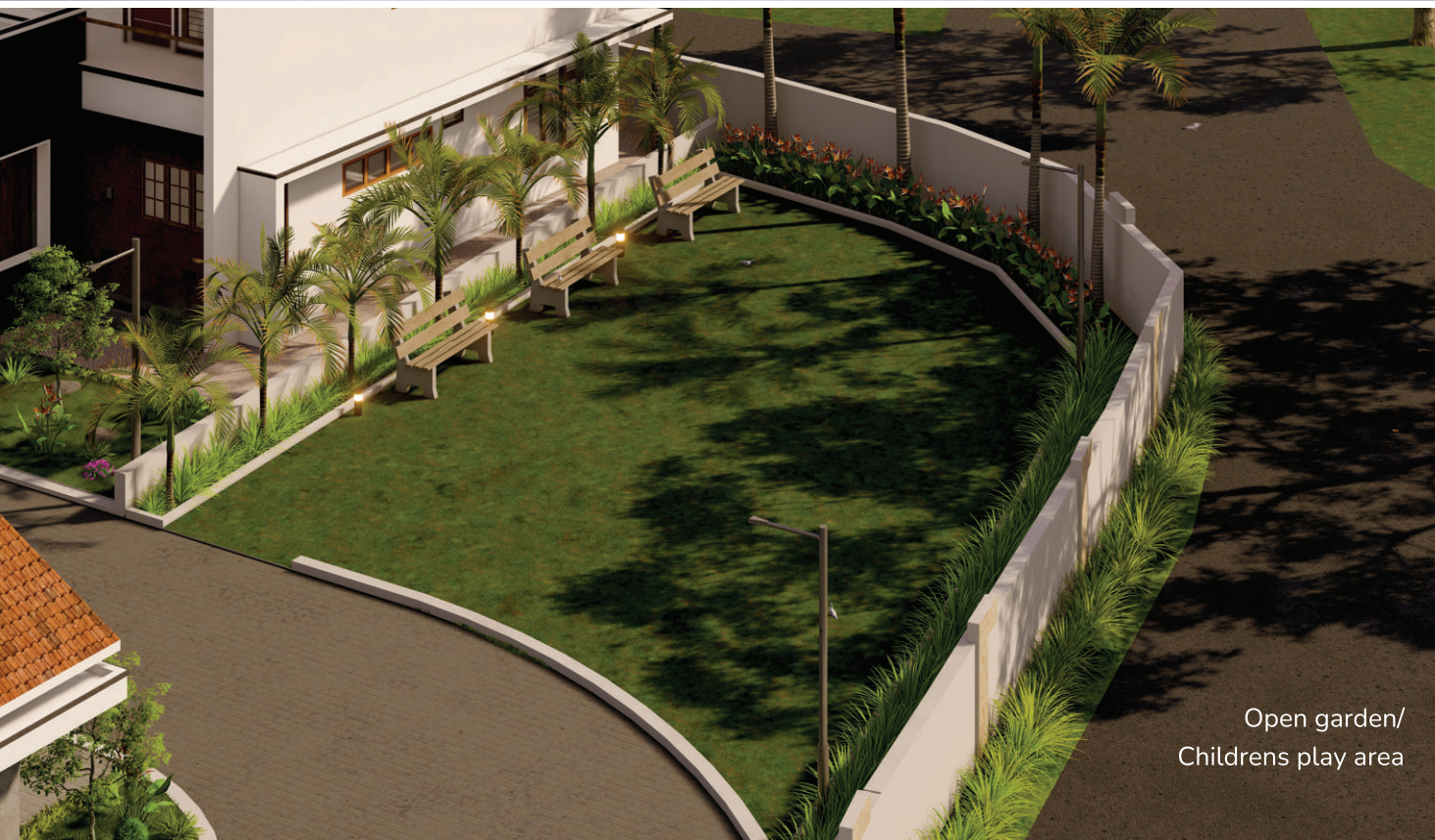
Open garden/ Childrens play area