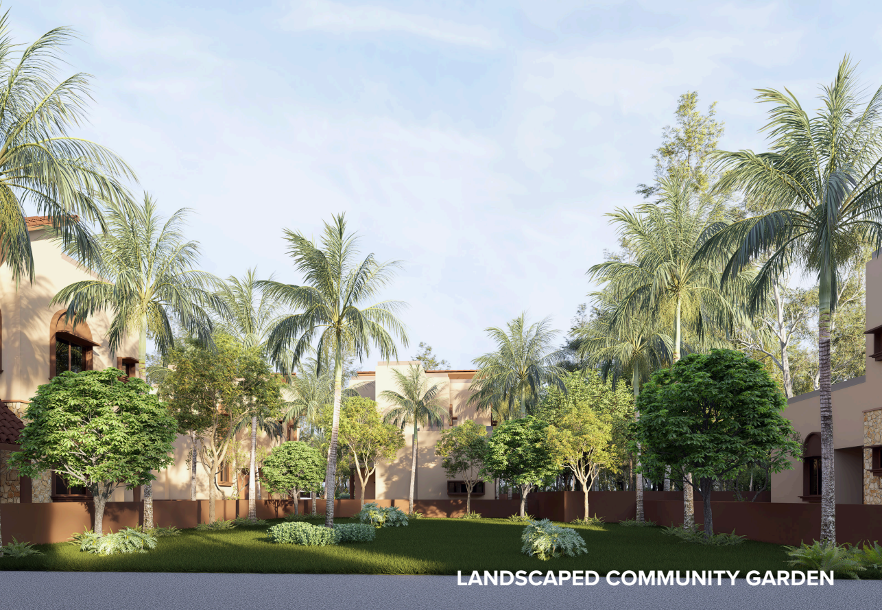
LANDSCAPED COMMUNITY GARDEN